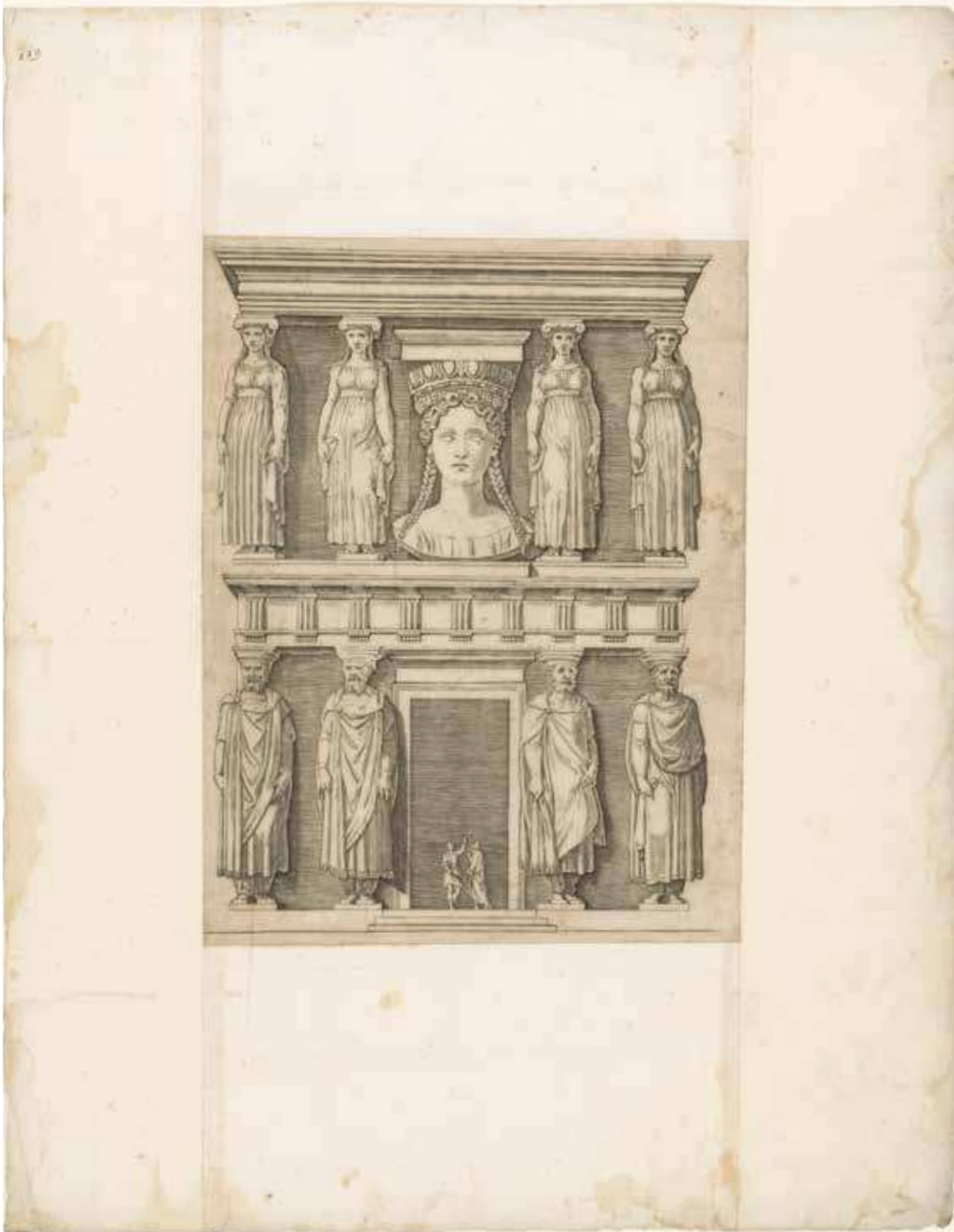
Figure 5.1 Marcantonio Raimondi, The Caryatid Façade , c.1520?, engraving, 215 × 239 mm, Amsterdam, Rijksmuseum, RP-P-OB-105.449