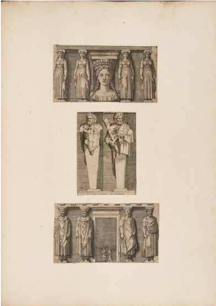
Figure 5.2 Marcantonio Raimondi, The Caryatid Façade, c.1520?, and Master of the Die after Agostino Veneziano, Two Hercules Terms, 1536. The John Rylands Library, Spencer 8050, fol. 34r.