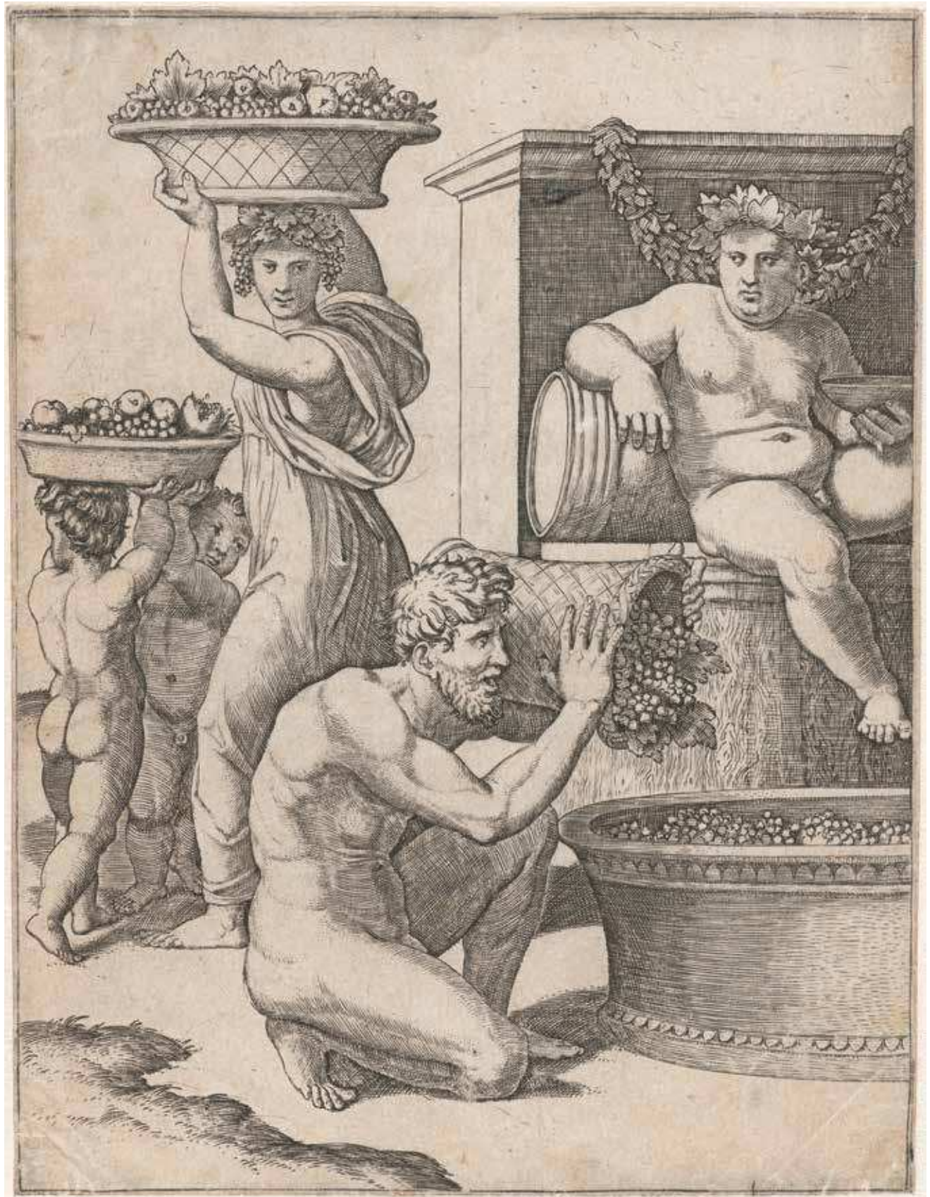
Figure 5.5 Marcantonio Raimondi, The Vintage , c. 1517-20, engraving, 190 × 144 mm, Amsterdam, Rijksmuseum, RP-P-OB-11.944