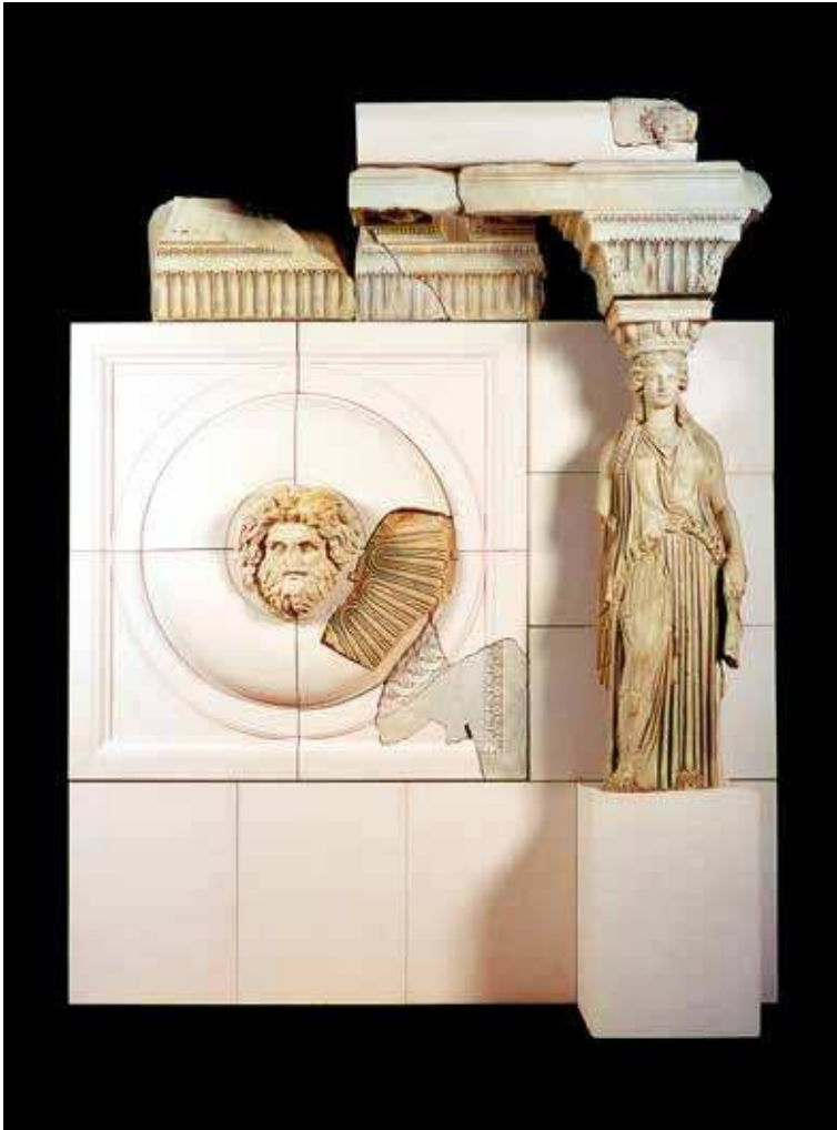
Figure 5.9 Caryatids from the Forum of Augustus, first-century CE copies of fifth-century BCE originals, Rome, Museo dei Fori Imperiali.